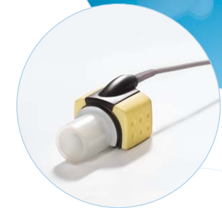
IRMA Airway Adapter and IRMA CO 2 Analyzer